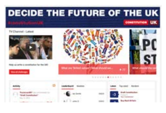
Figure 3. The online Constitution UK crowdsourcing platform, run by Crowdicity

The project managed to build a large online community while avoiding the high attrition rate seen in other online learning environments, such as the massive open online courses (MOOCs) that have become more prevalent in recent years.<sup>80</sup> Members of the project team suggested that the highly flexible and informal aspects of the learning environment, including the lack of lectures, formal teachers and assignments, were important as participants chose when and how to interact with the project. In surveys, the majority of participants stated that they had gained new knowledge (80 per cent) or skills (70 per cent) through the project. Half stated that working with others directly contributed to their learning experience.<sup>81</sup> Following on from the success of Constitution UK, the team is working on a roadmap of projects to draw on the potential of crowdsourcing to solve problems, address key issues and engage in digital citizenship.