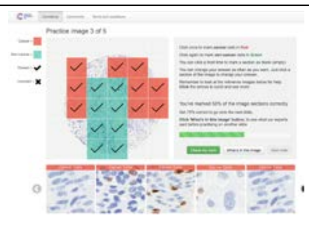
Figure 1. A screenshot from Cancer Research UK's Trailblazer project

Trailblazer's developers found a 'lean start-up' approach – an approach based on developing and testing hypotheses iteratively – to be particularly valuable. Instead of making assumptions about what training approaches would be most effective and then proceeding to build the platform, the team tested and evolved their approach with guidance from participants.