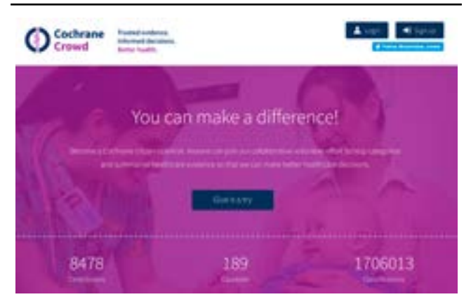
Figure 2. The Cochrane Crowd homepage

In addition to article classification, the Cochrane Crowd team are developing additional tasks for the crowd related to the identification of basic research study information such as Patient, Population or Problem, Intervention, Comparison and Outcome (PICO).